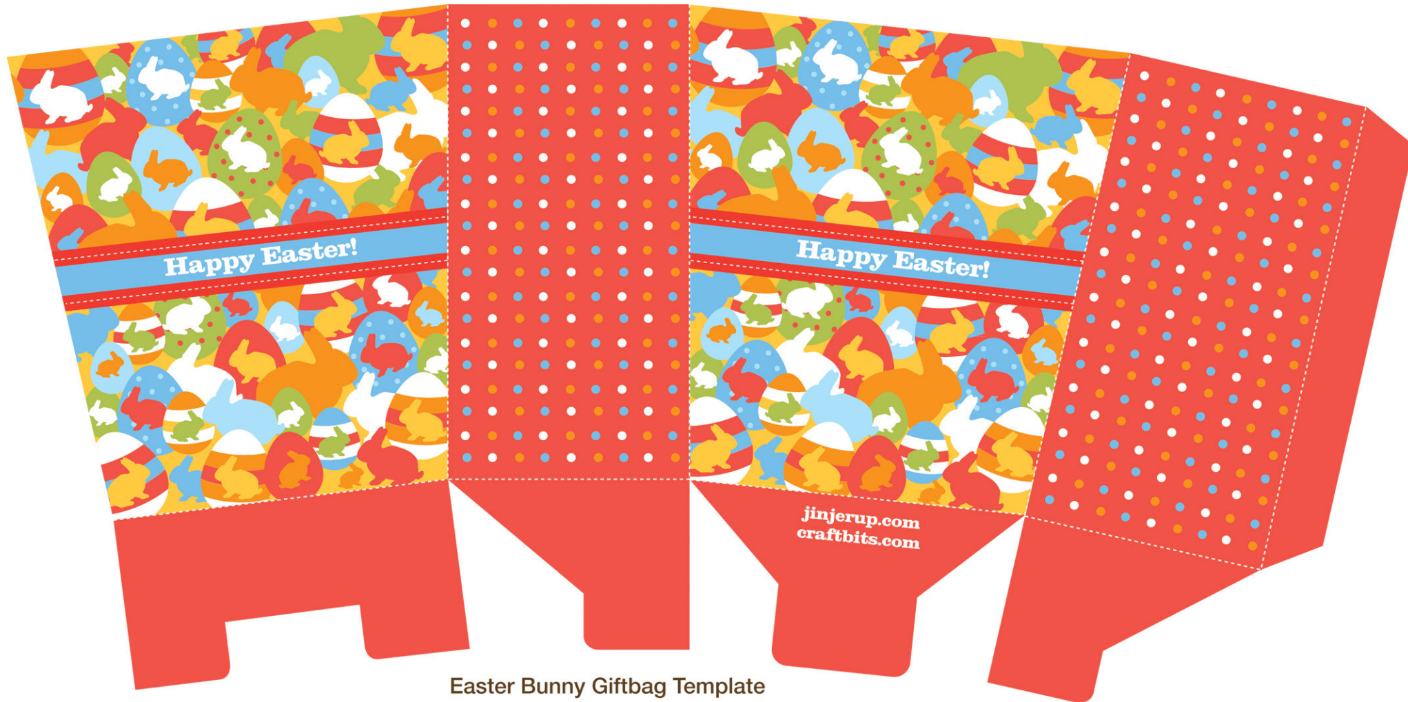
Easter Bunny Giftbag Template

Print this PDF on cardstock and cut the giftbag & handle templates. Fold according to folding lines and assemble the giftbag. Stick the side flap of the giftbag with glue or tape. Attach the giftbag to the inner top sides of the giftbag and fill with gifts for your loved ones. You can also gift this giftbag with easter bunny bookmarks and a cute little side pocket to store the bookmarks. You can download the bookmarks from jinjerup.com/blog . Refer to visual instructions on craftbits.com on how to put the Easter Bunny Giftbag together. { Please refer to Jinjerup Easter Bunny Giftbag Index for Jinjerup Terms of Use of this PDF File. This PDF is ONLY for unlimited printing for your own PERSONAL USE. }